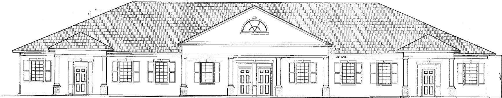
FRONT (south) ELEVATION